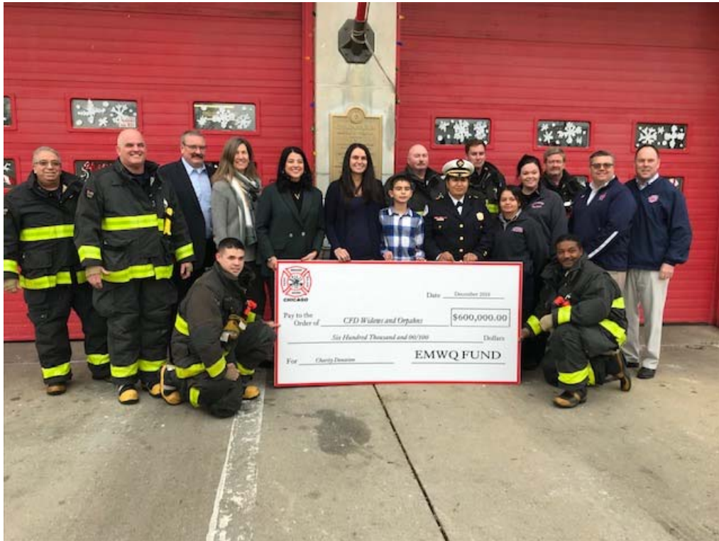
Photo taken at Engine 92's House on December 4, 2018

I would like to extend the "Board's" gratitude to the CFD family as well as all of our supporters for their generosity in supporting our neediest members. Thanks to all of you, we were able to distribute $600,000.00 to 480 of our neediest widows and children this holiday season.